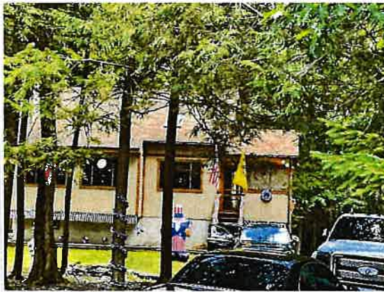
3rd Place: The Shuler Family