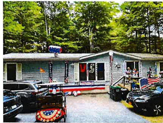
2nd Place: The DiBlasi Family