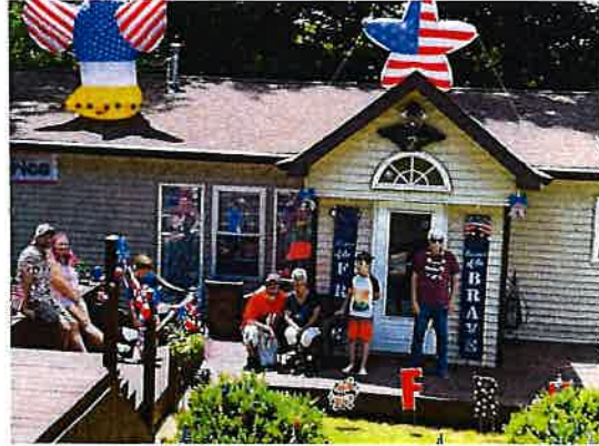
1st Place: The Pool Family