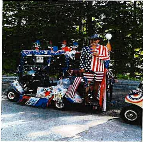
1 st Place: The Pool Family